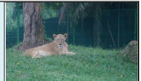
A Famosa Resort Animal World Safari

Price: SGD 117 per Adult SGD 103 per Child