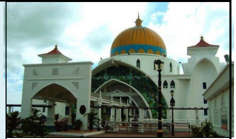
Melaka Straits Mosque