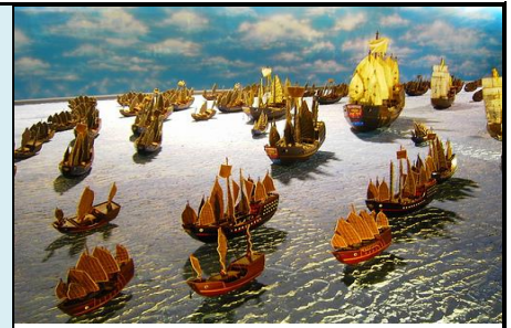
Cheng Ho Cultural Museum

** Not recommended for physical challenged & handicapped passengers.