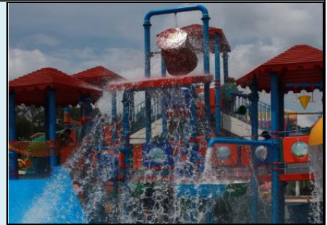
Malacca Wonderland Theme Park