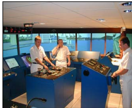
Incident conformed to simulator exercise