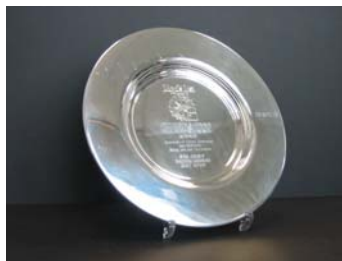
The Lloyd's List-SMM 2002 Awards